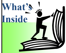
TABLE OF CONTENTS PROGRAM